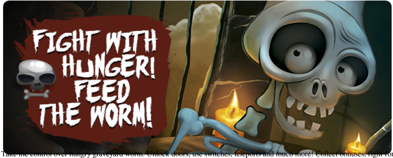
Take the control over hungry graveyard worm. Unlock doors, use switches, teleports and much more! Collect bonuses, fight for the best time and score! And all of this in that creepy atmosphere, addictive logic game.